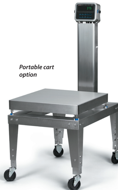
Portable cart option